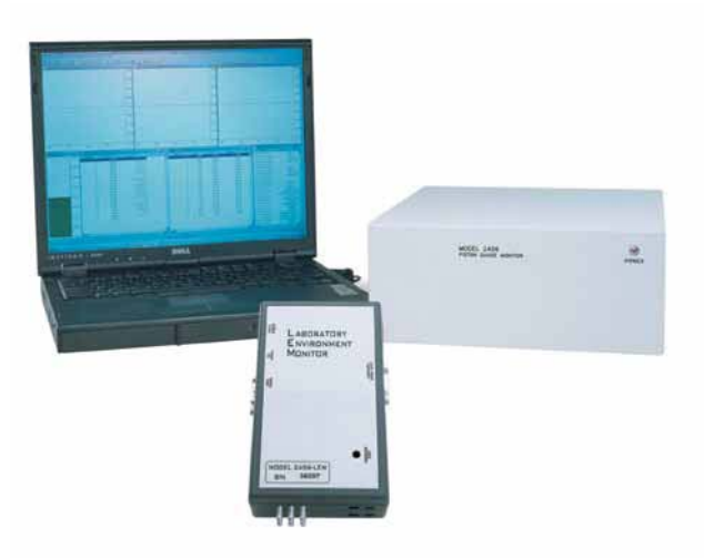
LEM with Model 2456 and WinPrompt

Fluke Calibration. Precision, performance, confidence .™