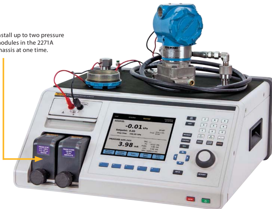
Use the 2271A to perform closed loop, fully automated calibration on 4-20 mA devices like this transmitter.

Install up to two pressure modules in the 2271A chassis at one time.