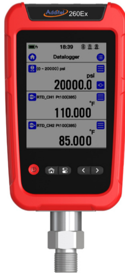
Additel 260Ex with ADT158Ex module